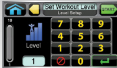
CHOOSE YOUR LEVEL.