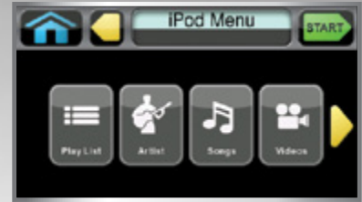
PLAY YOUR MUSIC.